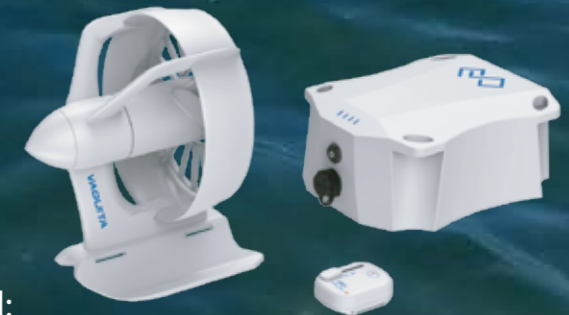
Optional rudder outboard:

All rights of KAICYCLES Trademark and the work reproduced reserved. Unauthorized totally or partially copying, printing, lending strictly forbidden. Violation of the rights to broadcast the work may constitute an offense against intellectual property (Arts. 270 et seq. of the Criminal Code). The Spanish Centre for Reproduction Rigths monitors compliance of these rights.